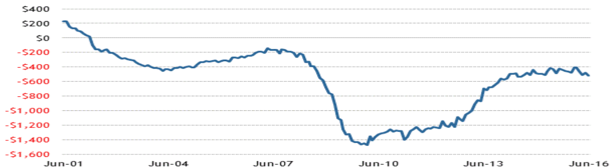
Federal Budget ($blns, Trailing Twelve Months)

Source: Treasury Department; updated 07/13/16